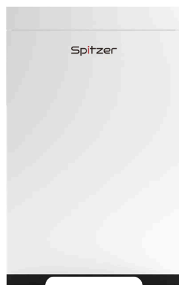
IP20-6 Floor Mount