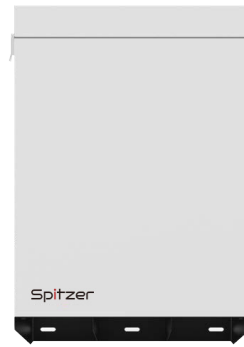
IP64-2 Wall Mount